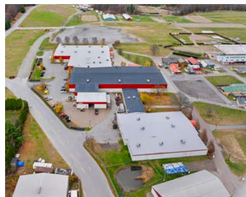
CHAMPLAIN VALLEY EXPOSITION CENTRE